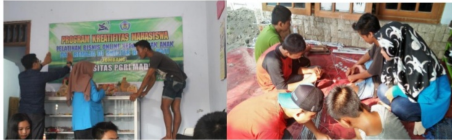
Figure 4. Training Preparation Activities