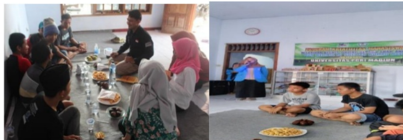
Figure 3. Socialization of Program Activities

The socialization stage was held on April 28, 2018, the stage of socialization is the general stage of material delivery. The first activity is to socialize everything related to online business such as what is meant to do online business, purpose, benefit and how to do business online, and explain our intent and purpose to children and teenagers who are in Shelter Rumah Hati Jombang to participate in this activity. The material delivered packed using media power point so that practical and easy to understand by the children and adolescents who are in Shelter Rumah Hati.