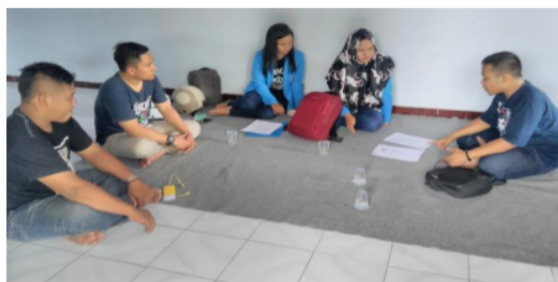
Figure 3. Observation and Situation Analysis Stage

Implementation of PKM-M activity started from observation to Shelter Rumah Hati Jombang on April 13, 2018. Observation activity was done to see the situation of children and adolescents who are in Shelters Rumah Hati in Jelak Village, and ask permission to conduct PKM-M activities there with the title "Online business training to children and teenager Shelter Home for Former Prisoners in Hamlet Jelak Ombo Jombang" which aims to facilitate the team in planning the program PKM devotion to be implemented.