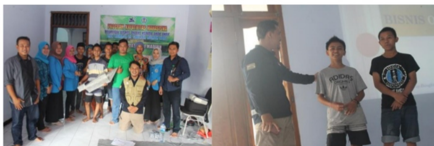
Figure. 5 Stage Training and Assistance

Evaluation of the program is carried out after this activity is completed, it is intended that after the participants attended this training can immediately know the level of understanding and competence of the participants and ensure that trainees are able to do business online in accordance with the outcome that the team expected. Based on the satisfaction questionnaire that we distributed to children and adolescents who are in Jombang House Shelter is 100% interested to do business online in the future, because after we submit their material antusia to open an online business there who want to open motorcycle parts business, selling his services or abilities such as lectures or tausyiah, and some who want to open an online business about farms, that is farm based online.